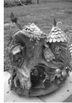
Driftwood Fairy House